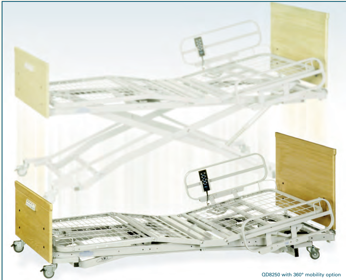
QD8250 with 360° mobility option