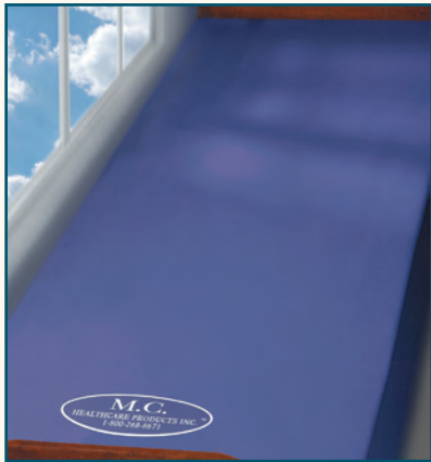
A wide variety of pressure reduction mattresses for MAXXUM series beds