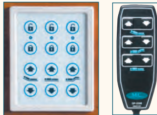
Foot end control Hand pendant with lockouts