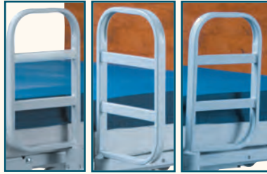
3 position assist rail