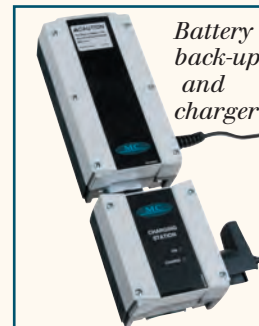
Battery back-up and charger