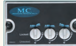
Individual motor lockouts