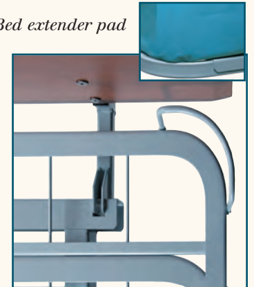
Bed extender pad