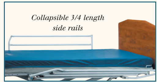
Collapsible 3/4 length side rails