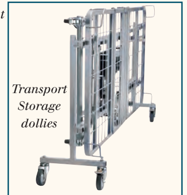
Transport Storage dollies