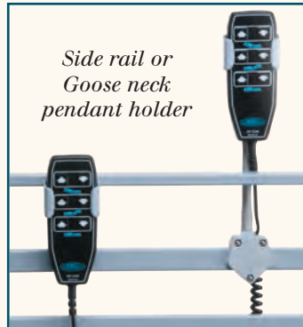
Side rail or Goose neck pendant holder