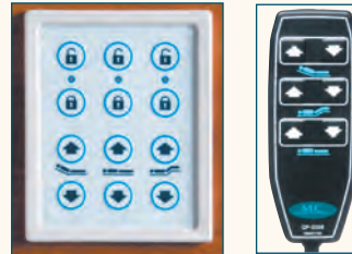
Foot end control with lockouts Hand pendant