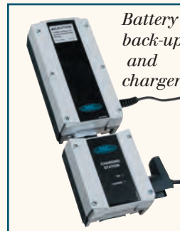
Battery back-up and charger