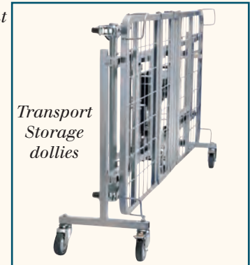
Transport Storage dollies