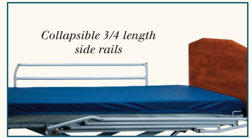
Collapsible 3/4 length side rails