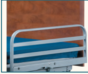
1/2 length head end side rails