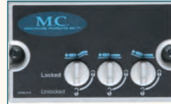
Individual motor lockouts