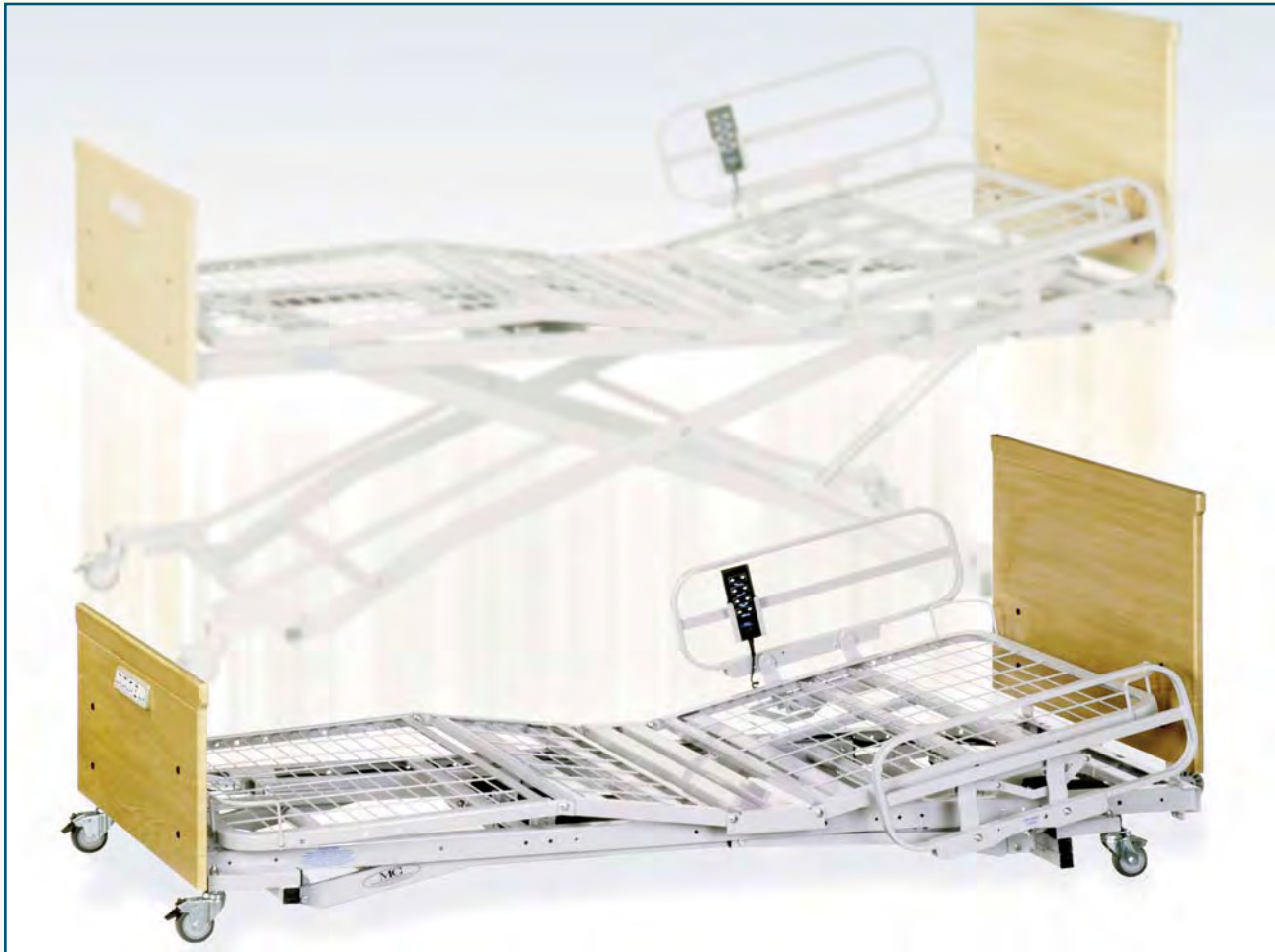
QD 8250 series - Fast MAXXUM - 7 7/8" - 30"