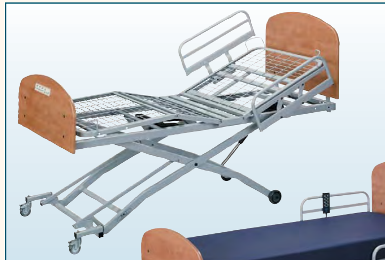
QD 8100 series - 77/8" - 28"