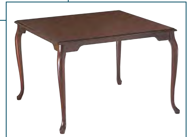
DR 250 Dining/Games Table