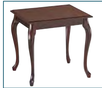
DR 219 End Table

200 SERIES - Queen Anne Leg 100 SERIES - Chippendale Leg