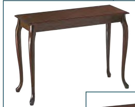
DR 240 Sofa Table

DR 218 Cocktail Table shown on cover DR 118 Cocktail Table shown on cover