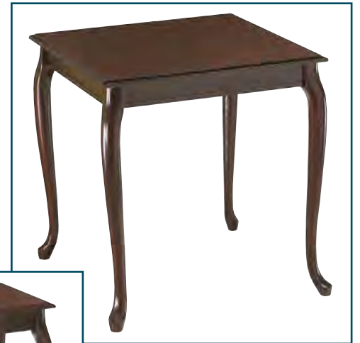
DR 230 Tea Table